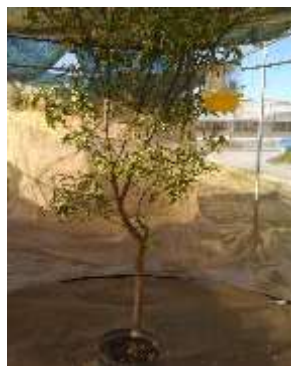
Figure 2. Trap on the tree within field cage.

Five cylindrical (2.9m diameter x 2m height) field cages were used, each housing one potted citrus tree. On each test day (replication) 100 adults (50 females and 50 males) were released in each field cage. Then, one trapping device was placed in each cage (fig 2). Captured adults were recorded every hour for each trap (8-9 records/replication). We run 10 replications in spring (Off-Season) and 10 in summer (On-Season). In each replicate, the traps in the field cages were rotated (1 rotation/replication).