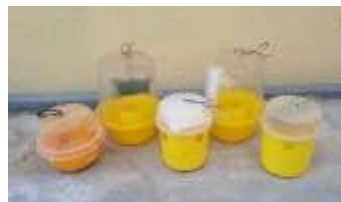
Figure 1. The attract-and-kill devices tested.